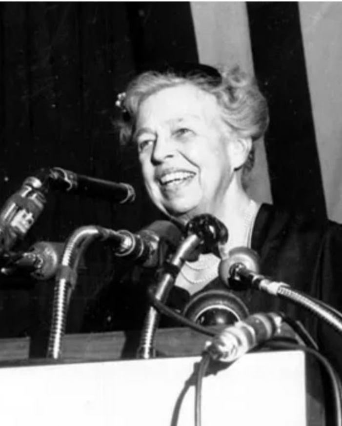
First Lady Eleanor Roosevelt speaking at an ASU conference.

Then you belong in the American Student Union!